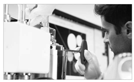
Profit from the optimized performance of your microscope system with services from ZEISS – now and for years to come.